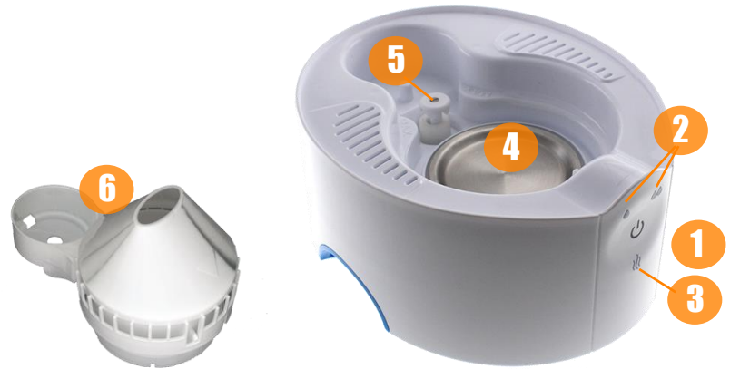
Fig. 2 (Water Tank)